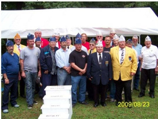
9 New members